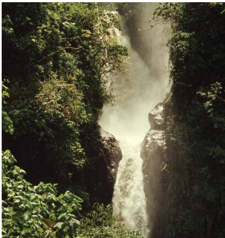
Waterfall in Braulio Carrillo National Park, Costa Rica.

In Costa Rica, an environmental flow assessment for the highly utilised Tempisque watershed by the International Union for Conservation of Nature (IUCN) and the Organization for Tropical Studies in 2004-05 raised awareness among stakeholders and politicians of the importance and feasibility of protecting flows to conserve ecosystem services. Following successful completion of the project, national and international experts worked with the environmental commission of the national congress to draft a new water law. At least five drafts and public reviews later, stakeholders and experts agreed that the draft law expresses important environmental flow concepts and features. The draft law defines environmental flows as the “quantity of water expressed in terms of magnitude, duration, seasonality and frequency of flows and the quality of water expressed in terms of ranges, frequencies and duration of the concentration of key constituents required to maintain a desired level of health in the ecosystem” and prioritises environmental flow secondary to human water supply and food security, but ahead of other economic sectors. Although the bill has so far failed to become law, the Instituto Costarricense de Electricidad, which is responsible for hydropower, is already attempting to operate schemes to the best possible environmental standards as outlined in the draft (Jimenez et al. , 2005; R. Córdoba, personal communication, 15 May 2009).