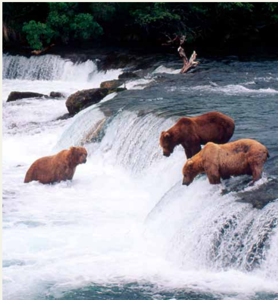
Katmai National Park, Brooks Range, Alaska

Clear institutional responsibility and capacity exist for assessing and implementing environmental flows. An independent authority audits performance of the policy; legal recourse is available to resolve conflicts.